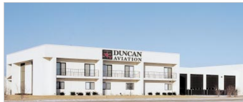
Duncan Aviation is relocating its Instrument & Avionics Component Services to a new 44,000 square-foot facility at the Lincoln Airport, just across the ramp from Duncan's four-hangar facility. The move will provide a 50% increase in shop floor space, allowing for growth and the addition of new capabilities.