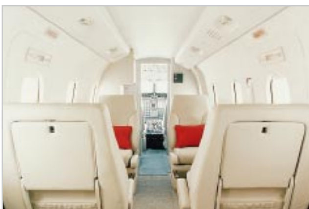
Duncan's interior Westwind recompletions have included custom one-piece composite windowline panels, thermal and acoustic insulation and high-gloss faux finishes.

For all-weather flying, Honeywell's Turbulence Detection Weather Radar system has been a good choice. From minor changes to complete avionics upgrades, including Collins EFIS85, Duncan's modifications department does