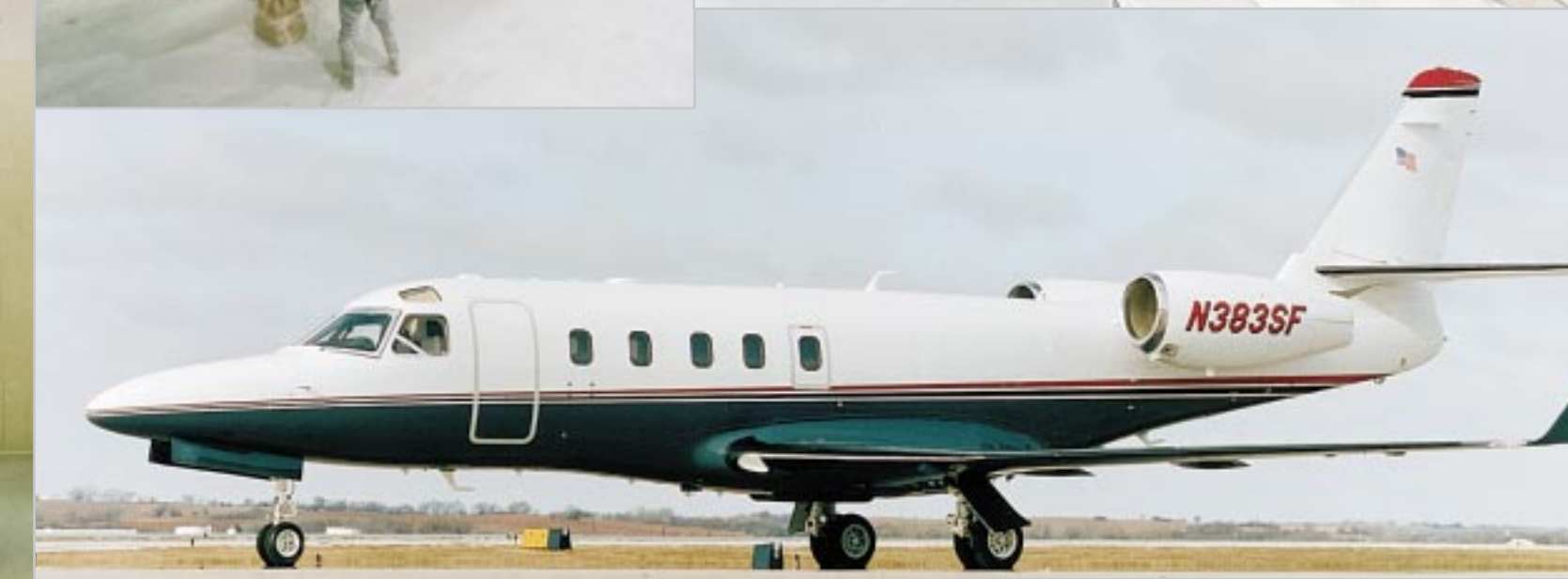
The exterior paint scheme was designed with Burgundy and Black stripes and a Dark Gray base color to coordinate with the interior color scheme.