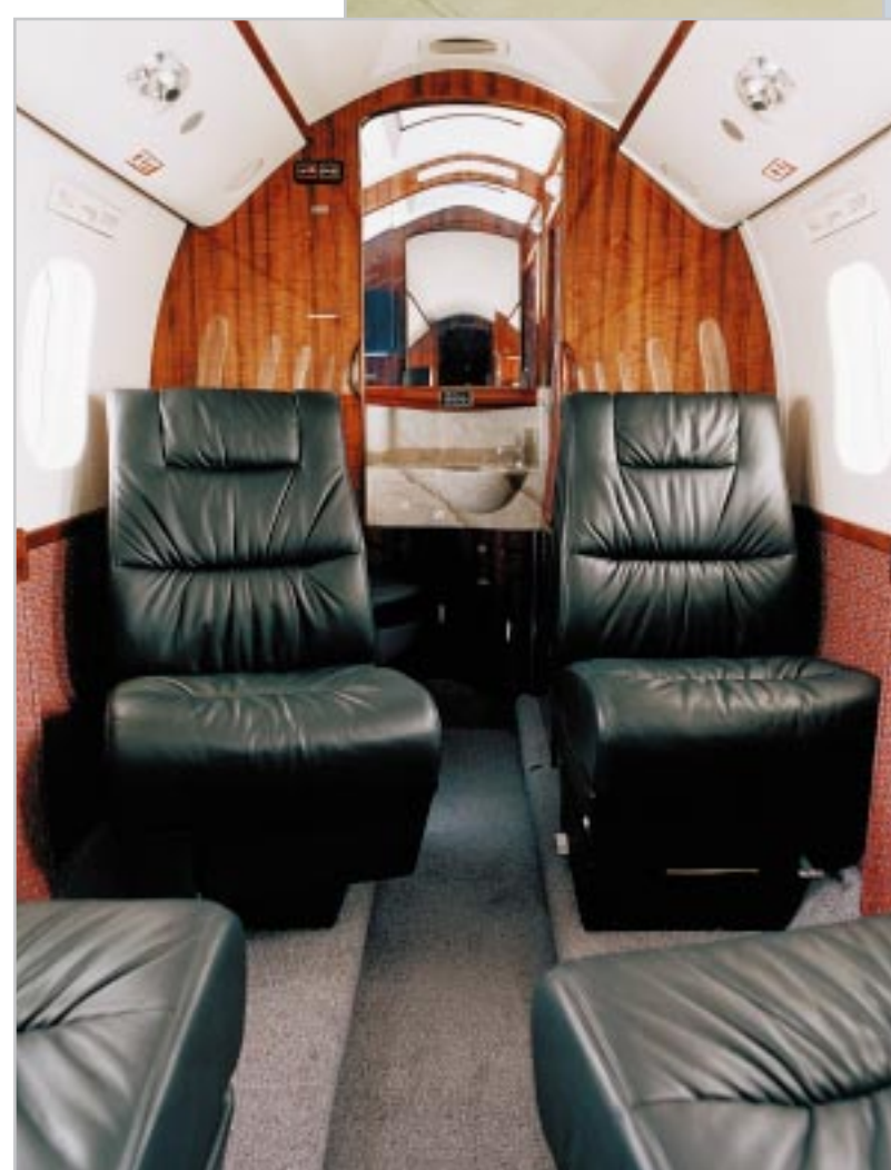
The lavatory includes an externally serviced, electric flushing toilet custom-designed vanity cabinet and baggage/garment storage compartment. The vanity cabinet incorporates a stainless steel sink, faucet, trash compartment, tissue dispenser and custom "faux-finished" countertop.